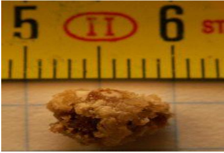
A formed kidney stone